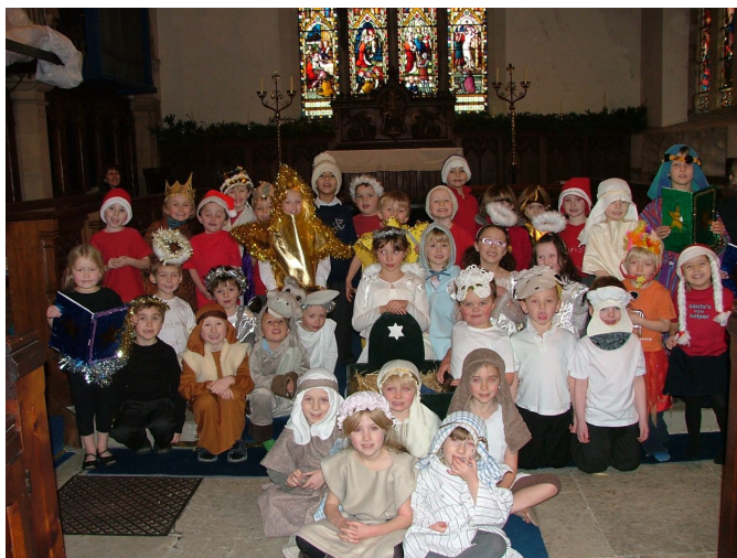
The children of Topcliffe School performed a lovely nativity play at St Columba's for parents and friends.