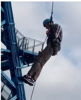
Going down - there's no turning back now!

Topcliffe's scout group is one of 36 units from North Yorkshire and Durham who will be sending scouts to the Jamboree, and they'll be representing the UK as a whole.