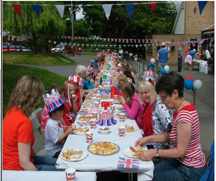
Topcliffe School children had a very memorable Jubilee Party followed by a disco in the evening.