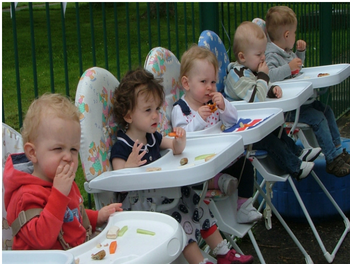
The babies weren't bothered what was going on as long as there was plenty of food.