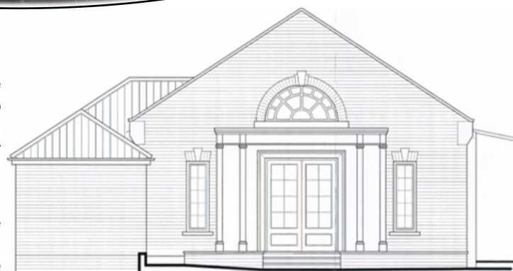
EAST ELEVATION AS PROPOSED